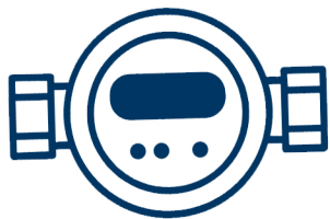
Water meter records data