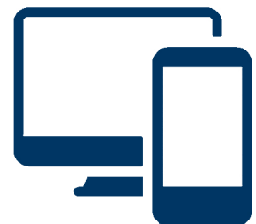
Data sent to SCWD & customer