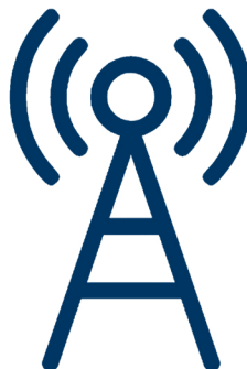
Data collected via radio frequency